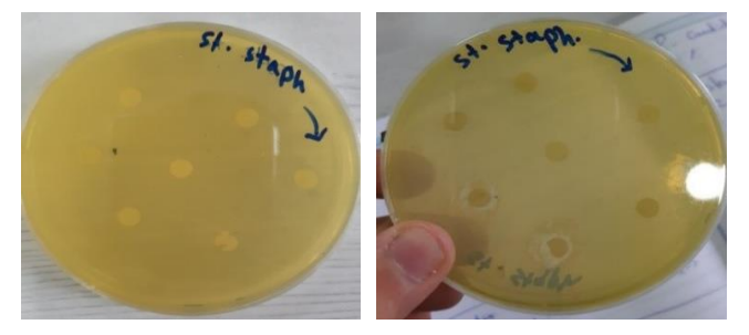
Fig. 2: Stem extracts effect on Staphylococcus aureus