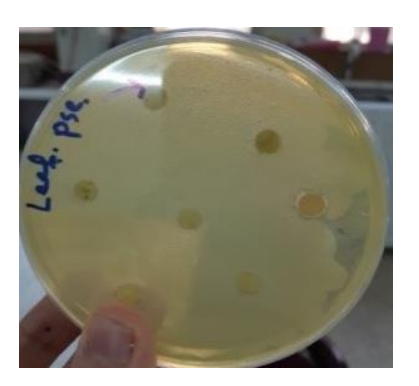
Fig. 4: Leaf extracts effect on Pseudomonas aeruginosa