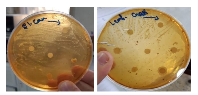
Fig. 5: Flower and leaf extract effect Candida albicans.