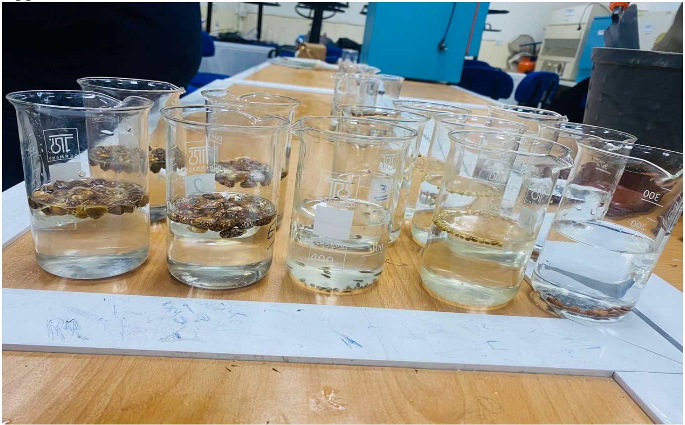
Figure 1: Soaking the Plant Seeds in Water.