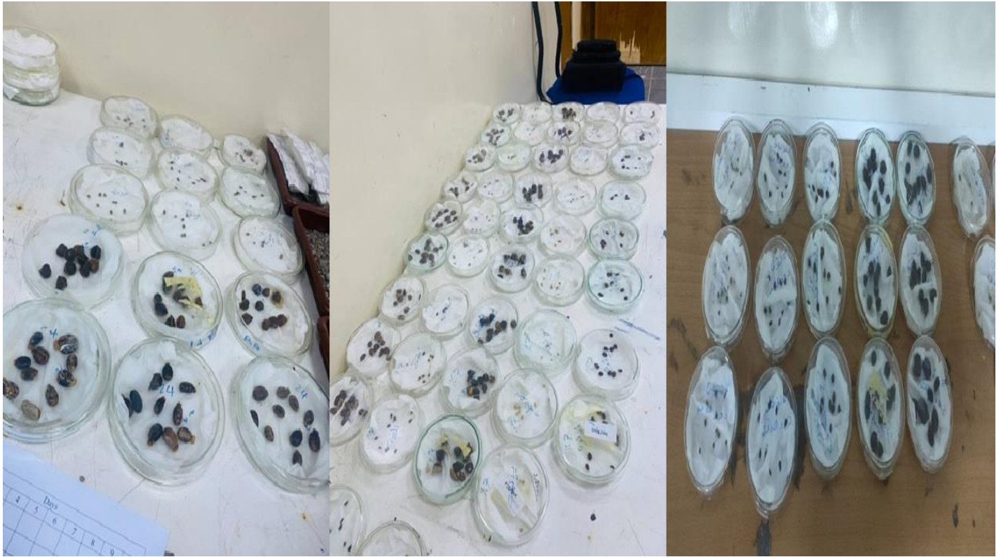
Figure 5: The Seeds were Put in Petri Dish and Designed.