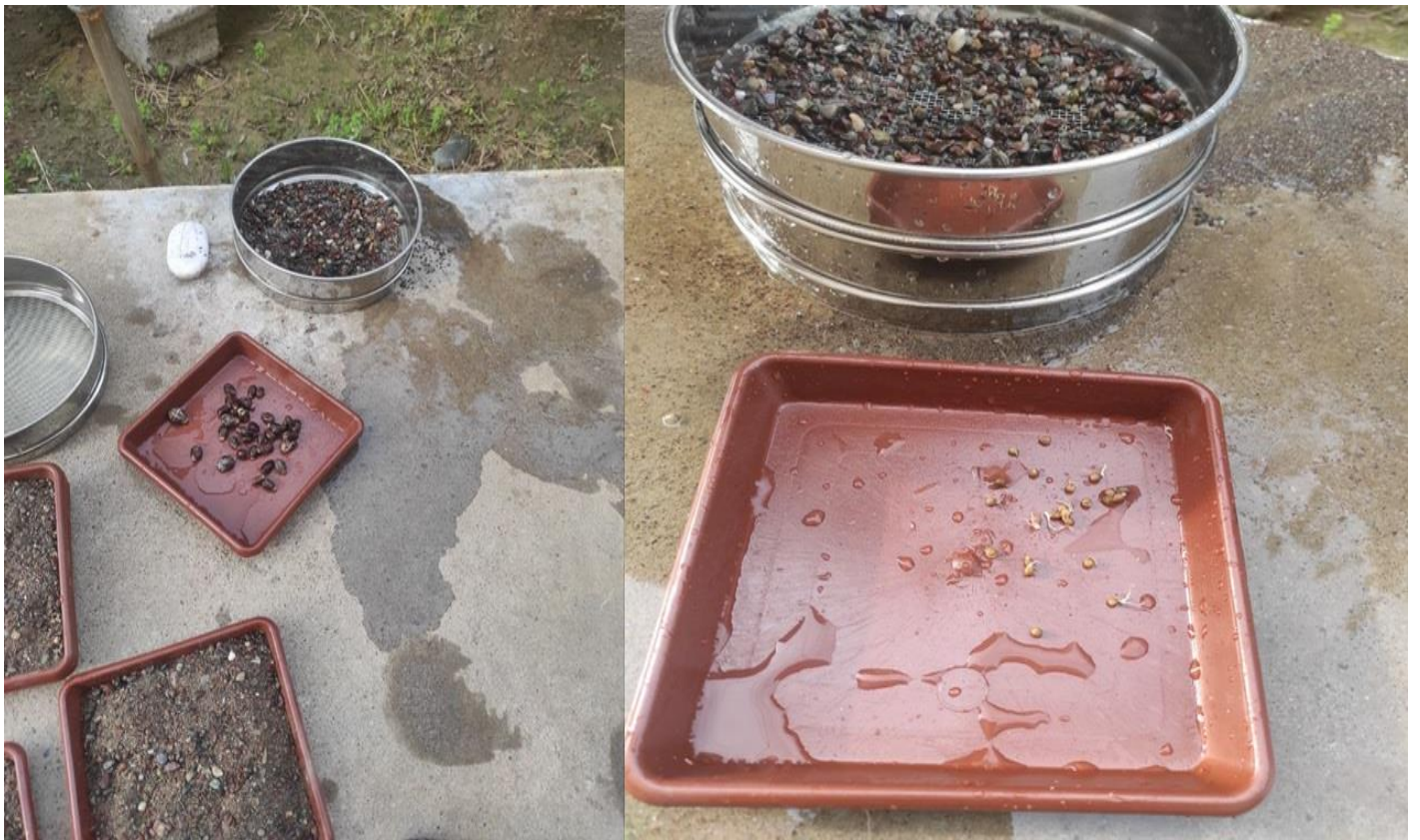
Figure 4: Separating the Seeds from the Sand after the Stratification.