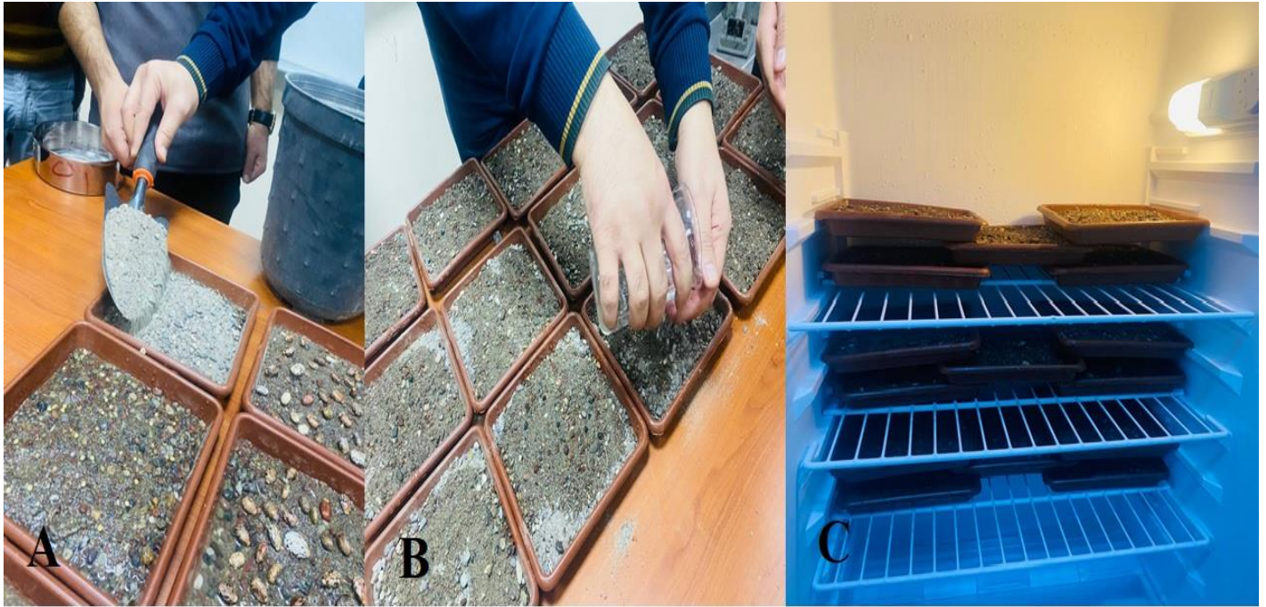
Figure 3: Steps of the Seeds Stratification.